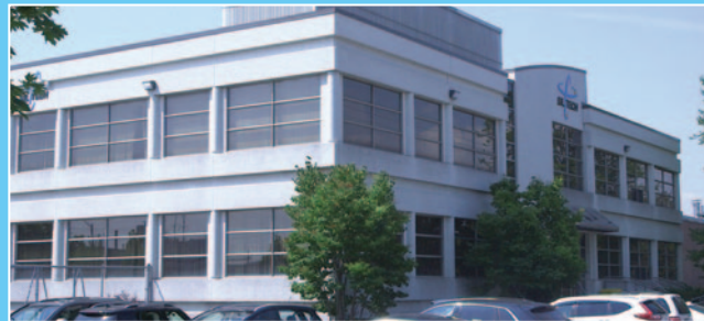
Toronto Head Office, Application Labs and Plant