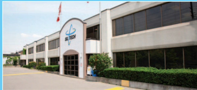
Mississauga, Ontario, Canada, Research Labs and Plant